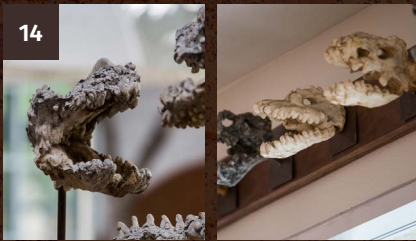
Kim Henkel, Three Stooges; No Two Individuals are Exactly Alike