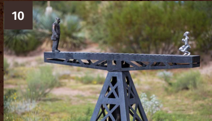
Joe Dal Pra, Control and Obsession 2